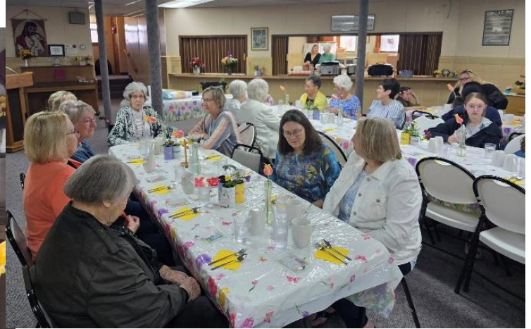
CLC Mother/Daughter Tea