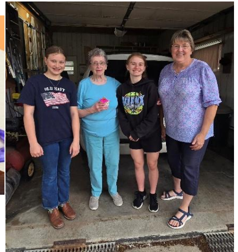
Confirmation Students delivered May Day Baskets