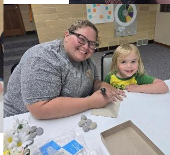
CLC Family Fun Night